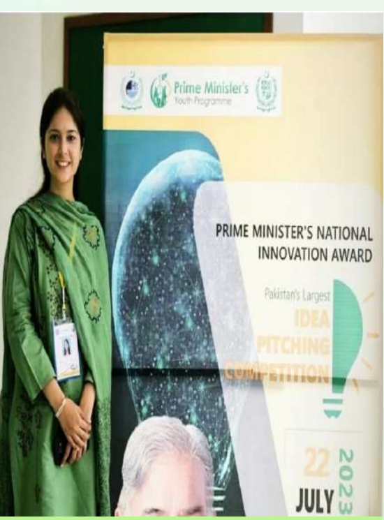
One of IMT's graduate project shortlisted for Prime Minister's National Innovation Award, 22<sup>nd</sup> July, 2023