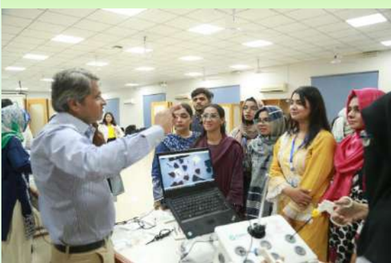
Workshop on laparoscopic techniques, 10th October 2022