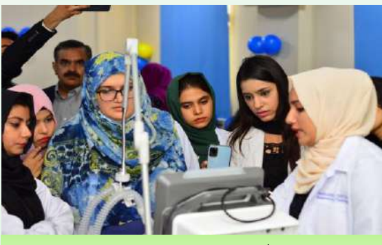
Mechanical Ventilator Workshop 2022 (3<sup>rd</sup> December 2022)